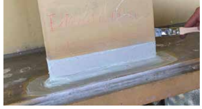
A brush is used to spread the 2-pack coating material evenly.