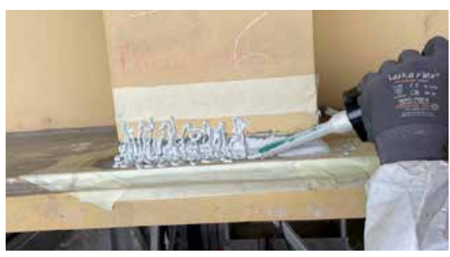
Easy application of Repacor SW-1000 on a welding seam thank to its handy cartridge.

Thanks to its practical mixer cartridge, this solvent-free, innovative 2-pack coating for maintenance or repair of mechanically damaged coating areas meets all requirements for a fast repair. Originally developed as a repair coating for rough offshore conditions and succesfully tested in practice for many years, the product is also very suitable for use on other industries. Whenever a fast, but high quality and durable repair coating is needed.